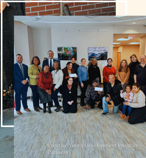
Creative Youth Development Program Partners