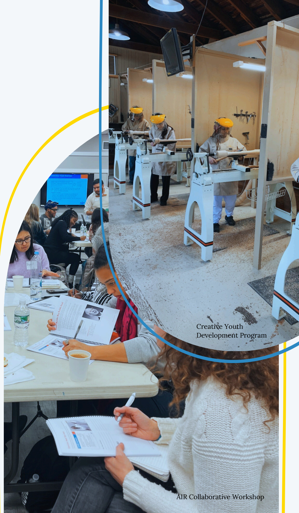
Creative Youth Development Program